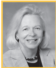
Mary Downs Academy Executive Director